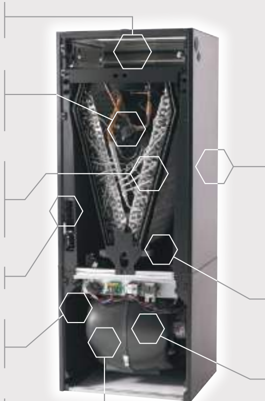
Features and components applicable to Hyperion TAM8 Series only, may vary by model and are shown for illustration purposes only.

➤ Vortica™ Blower uses less energy than conventional blowers to deliver more air, while reducing carbon emissions and noise.